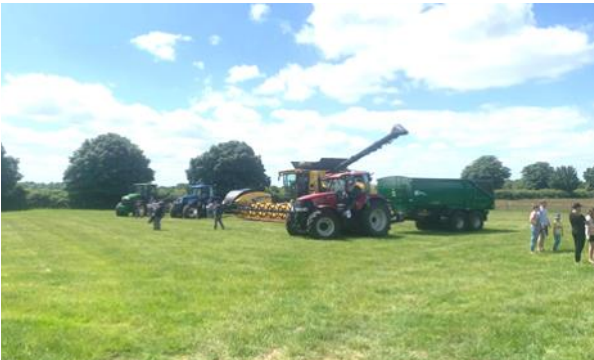
Our tractors and combine