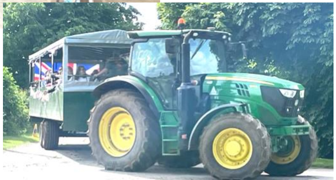
The ever-popular tractor and trailer ride