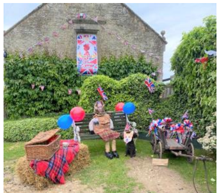
Clockhouse Stables' winning decorations