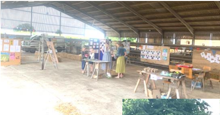
Games and competitions set up