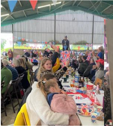
Jubilee picnic at Forceleap