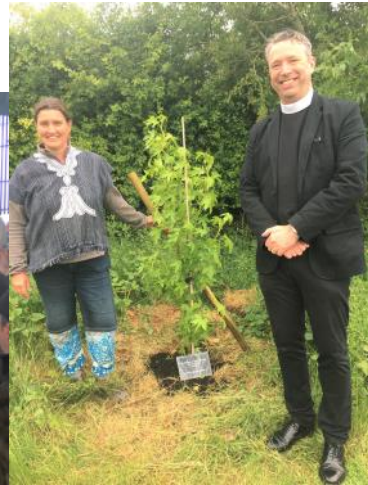
Treeplanting at the Playing Field